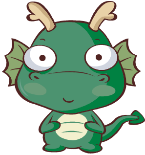
Home of the "Dragons"